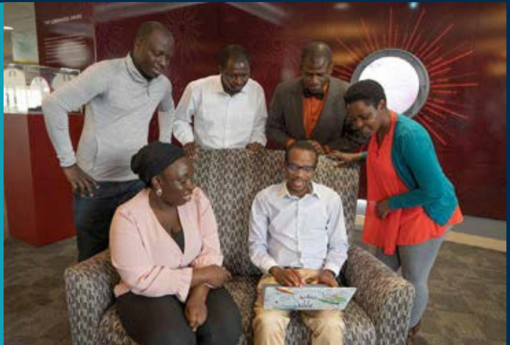
Photo: Worcester Polytechnic Institute in Boston, USA, an RSIF international partner institution, is hosting the inaugural group of RSIF PhD scholars, which include students from the African University of Science and Technology (AUST), Nigeria.

Three Nigerian universities have been competitively selected by PASET as RSIF African Host Universities.