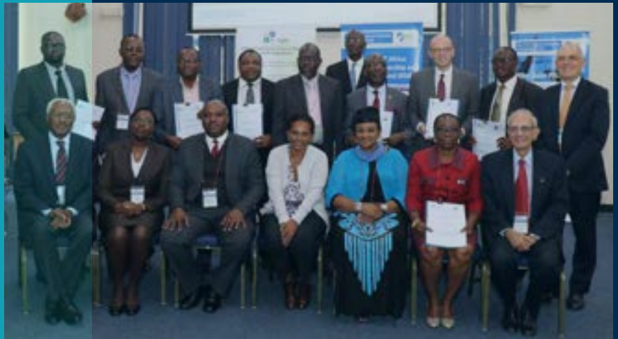
Photo: Nine Nigerian faculty members from AUST, BUK and UniPort benefited from RSIF grant writing training at icipe , in January 2020.

Photo: RSIF host university agreement between AUST, BUK, UniPort and icipe , the Regional Coordination Unit for RSIF, was signed in Nairobi, Kenya in presence of the PASET Governing Council and the Executive Director of the PASET Executive Board on the 7 October 2019. Read more